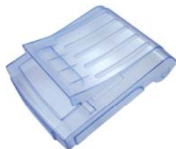
Spill proof cover