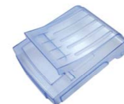
Spill proof cover